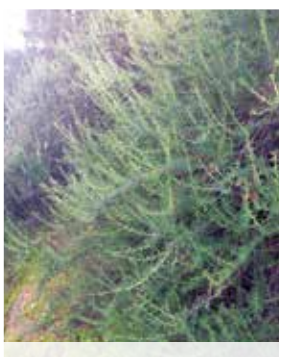
Eriogonum fasciculatum, BUCKWHEAT