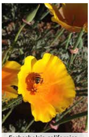
Eschscholzia californica, CALIFORNIA POPPY

Shown here are a few of the California native plant species successfully self-propagating this year.