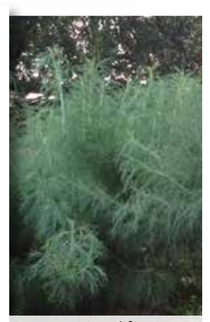
Artemisia californica, ARTEMESIA