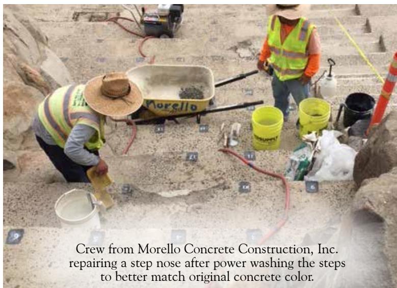
Crew from Morello Concrete Construction, Inc. repairing a step nose after power washing the steps to better match original concrete color.

The Board of Directors has established a reserve account for the purpose of maintaining the beautiful facilities within the park. Thanks to generous Park donations over the years, along with proceeds from the last heART gala, and major gifts restricted to this project, the necessary funding was available to undertake this work. The Board is gratified to use these contributions and thanks all who have helped support the park in this endeavor. ■