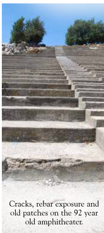
Cracks, rebar exposure and old patches on the 92 year old amphitheater.